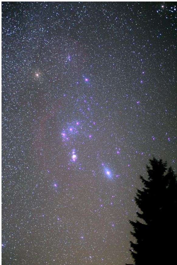
Constellation Orion over a star park

This document contains a basic set of recommended policies and monitoring options for protected areas regarding the protection of the nighttime environment and sources of information for further guidance. These recommendations are intended to provide you with a first practical orientation. They reflect practices that have already been adopted successfully in numerous protected areas around the world, including parks that have been certified as “Dark Sky Areas”. The values provided in this document are based on the state of knowledge in early 2015.